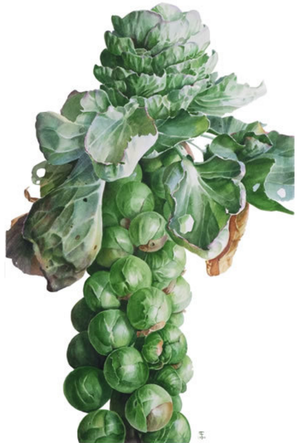
Brussels Sprouts © Paul Fennell SBA